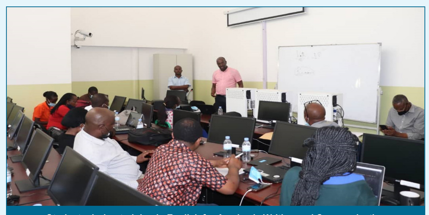
Students during training in English for Academic Writing and Communication

21<sup>st</sup> to 24<sup>th</sup> December rom 2021. 29 PhD students held a four day training on English for Academic Writing and Communication. The training aimed at quipping PhD students with English for Academic Writing and Communication, distinguishing types of Academic Writing, acquainting students with skills to write publishable articles and familiarizing PhD students with referencing styles and avoiding plagiarism.